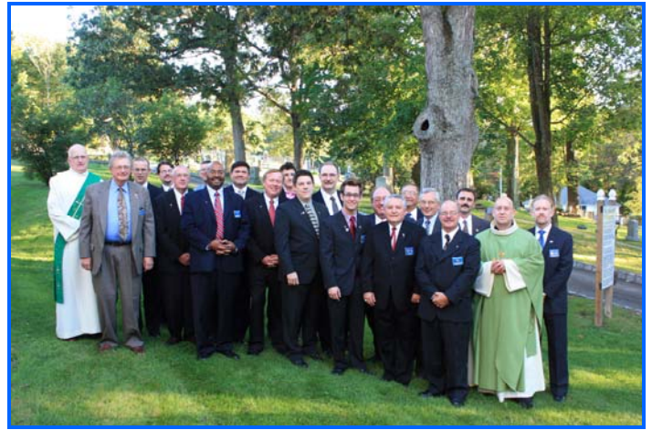
After the K of C Council Installation Mass 9/19/09

Thanks to all who participated making this a truly memorable Past Grand Knights Dinner!!!!!!