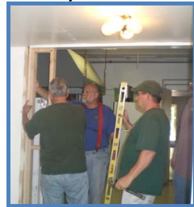
(Is it straight yet?)